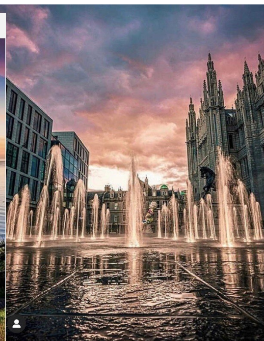
Aberdeen City Centre