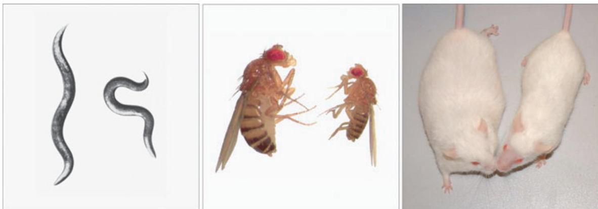
Fig. 2 Photographs depicting long-lived insulin-like growth-factor signalling (IIS)-mutant worms, flies and mice. The left panel shows a Daf-2 mutant worm adult and a Daf-2 mutant dauer (right of panel). A dauer is a developmentally arrested stage that is stress resistant and long-lived and typical of IIS-mutant worms. The middle panel shows a long-lived chico 1 homozygous female dwarf (right of panel) next to a wild-type female. The right panel shows a control and a long-lived fat-specific insulin receptor knockout (right of panel) mouse [16]. In this case, the long-lived mouse is smaller due to a lower fat content than control and not due to a developmental defect. Thus, it is possible to lower IIS activity in a manner that extends lifespan with no discernible detrimental effect on other aspects of physiology.

A great deal of the work that has been presented so far is based on genetic analyses. Whilst these have brought a wealth of understanding, they are only one part of the physiological picture and therefore cannot provide us with a complete understanding of