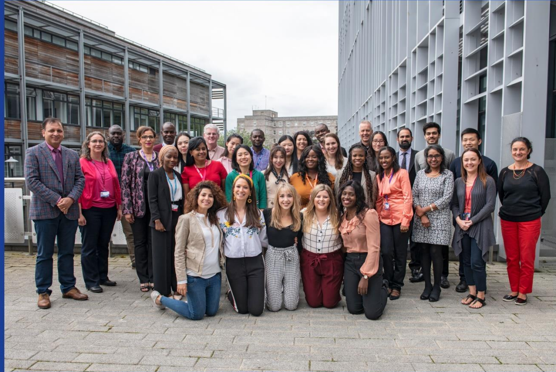
Master of Public Health (MPH) 2018-2019

India, Singapore, Syria, Nigeria, Japan, Pakistan, Kuwait, Canada, UK, Germany, China