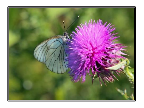
Figure 1: The elusive butterfly<sup>1</sup>

The image of the butterfly in the title of this paper is meant to capture in a single snapshot some of the circumstances that have put Scottish Standard English (SSE) at a disadvantage compared to other standard varieties of English. Here, 'disadvantage' means that the variety is somehow less visible, less rigorously explored, and perhaps taken less seriously than others – in short, it has remained a hard-to-spot variety that continues to slip the net of linguists.