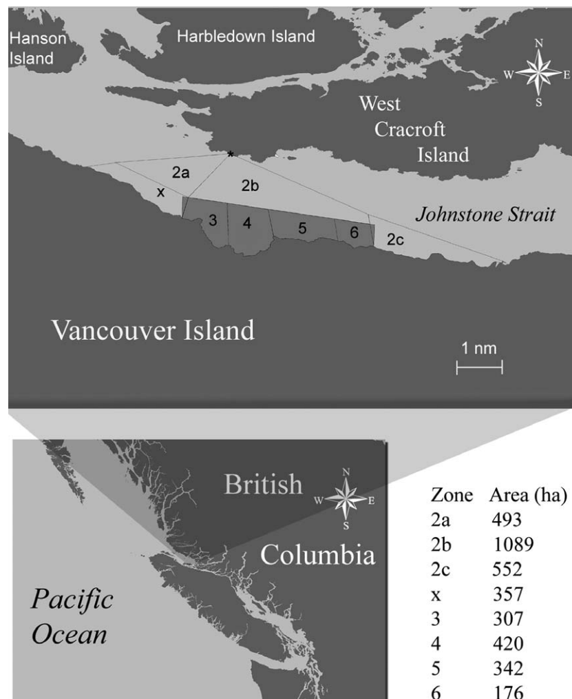
Fig. 1 – The study area bounded by lines drawn from the cliff-top observation site (*). Shaded area of zones 3–6 marks the boundaries of RBMBER, and zones X and 2a–c indicate the boundaries of the study area outside the Reserve.

Three killer whale ecotypes are found in the coastal waters of British Columbia (BC), Canada (Ford et al., 2000): mammal-hunting transients ; recently identified and poorly studied off-shores ; and northern and southern communities of fish-eating resident killer whales. A core area for “northern residents” is found in Johnstone and Queen Charlotte Straits (Fig. 1;