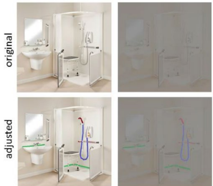
Example stimuli showing the effects of enhancing the visibility of bathroom features

With these approaches, the project hopes to deliver new insights into how the visual system works. Excitingly, the results of these studies may also be used to develop better visual environments in a variety of settings. For example, the project incorporates focus groups with older adults to find out what they find easy and difficult in their environments,