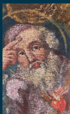
Exploring the New Testament Lecture - 11:00

Here is an example of a typical day as a 'Divine' studying towards a degree in Theology and Religion: