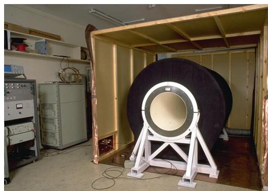
Figure 2: the whole-body FFC MRI scanner used for our studies.