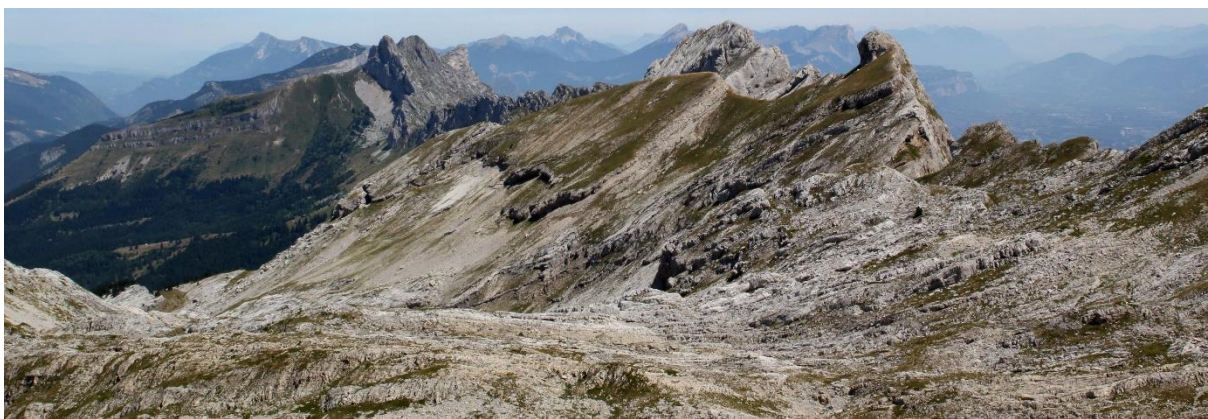
Vercors fieldwork. Top left: hangingwall of Rencurel Thrust at La Balme de Rencurel. Top right: bedding data from the Vercors fold-thrust belt. Bottom: Urganian limestone dip-panels above Villard-de-Lans.