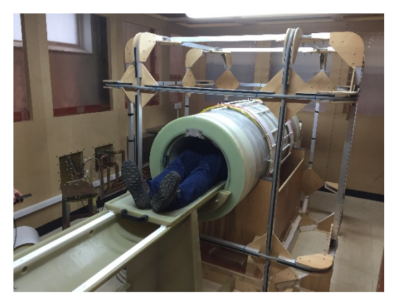
Figure 1: The FFC-MRI system