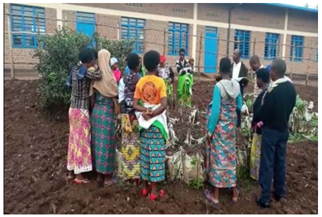
Photo. Case study: Adult learners taking part in a compost manure making for kitchen gardens

The SPA is practice-oriented and focuses on people's everyday lives and livelihood practices. It considers learning as purposeful and embedded in people's social contexts.