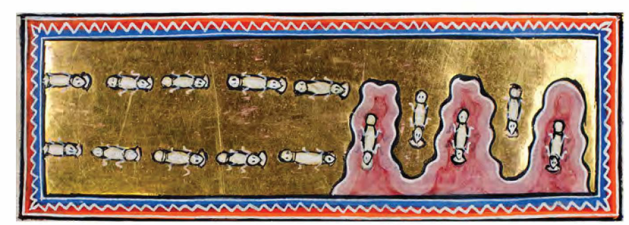
Ants march in line carrying grain in their mouth. They collect the grain in two stores to reduce the chance of rain damage.

The ant has three characteristics. The first is that they march in line, each one carrying a grain of corn in its mouth. Those who have none, do not say to the others: 'Give us some of your