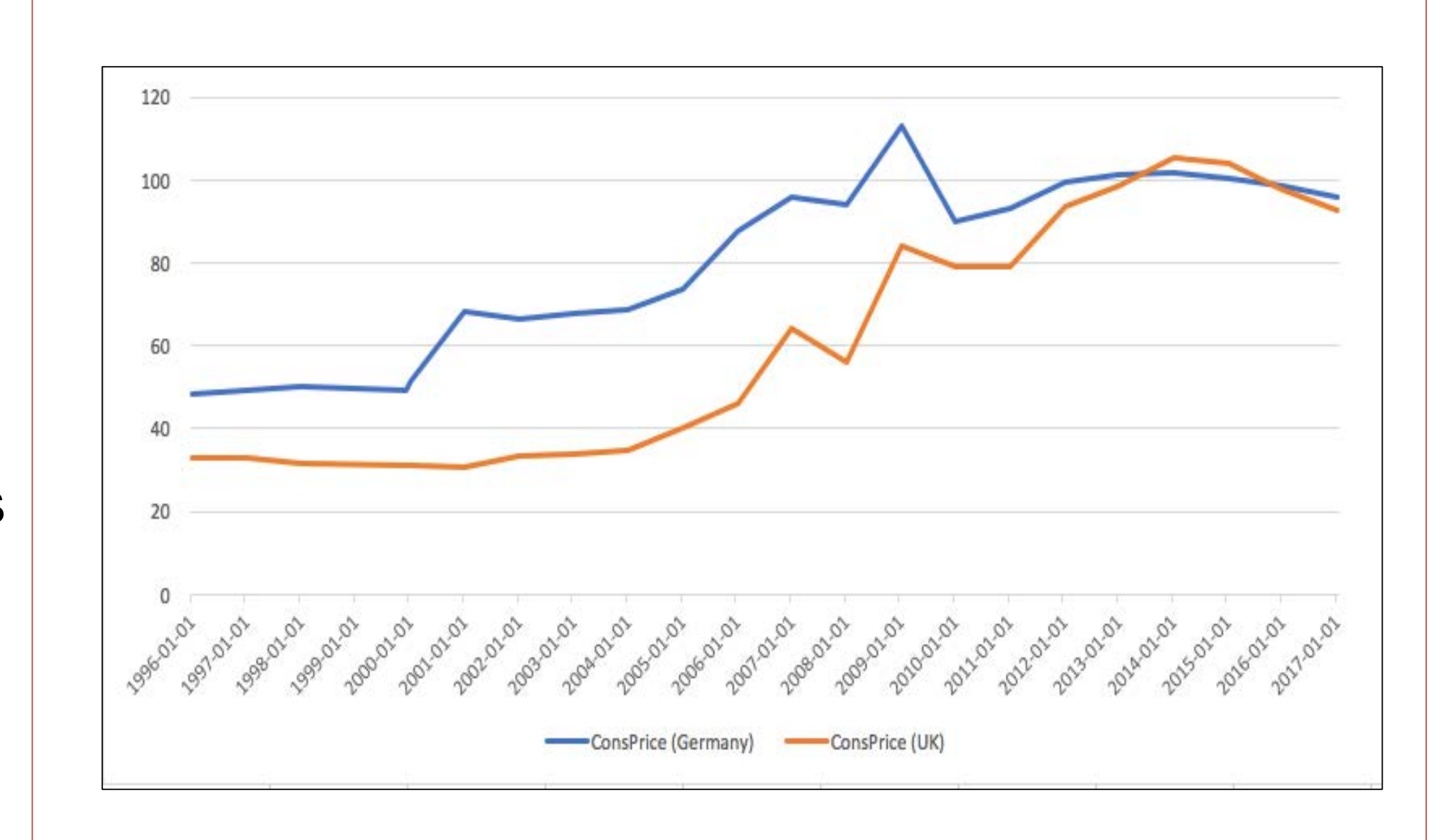
Fig2: Evolution of retail price index of natural gas.