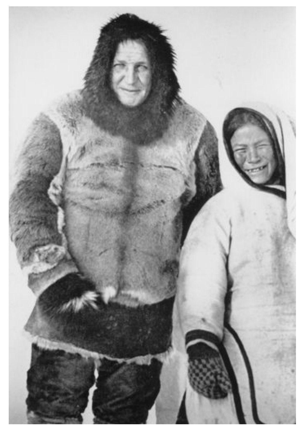
Figure 3 Robert Flaherty and Nyla, c. 1920.