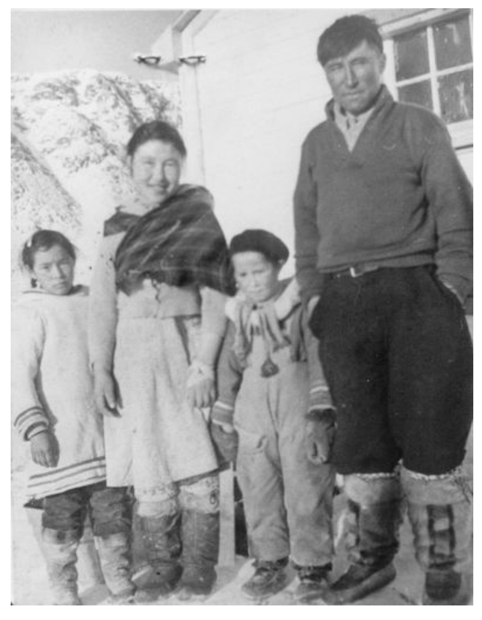
Nanook of the North as Primal Drama 217