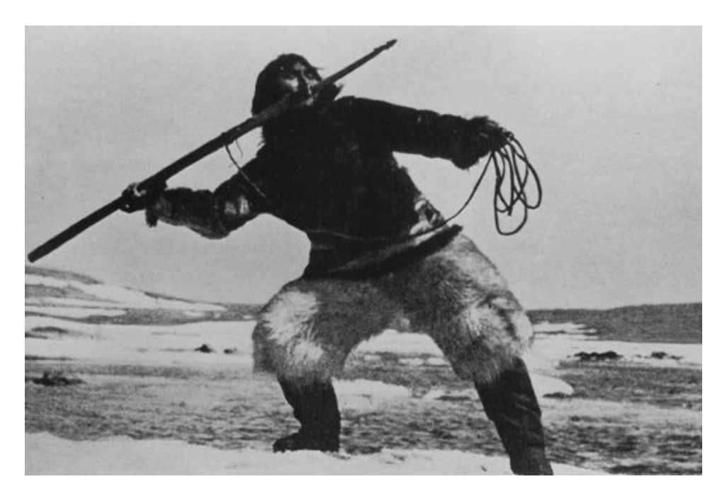
Figure 2 Nanook of the North, 1922. (Credit: Robert Flaherty)

The artifice continued in the way Flaherty orchestrated, reconstructed, and embellished scenes. The film's illusion of authenticity masked the fact that