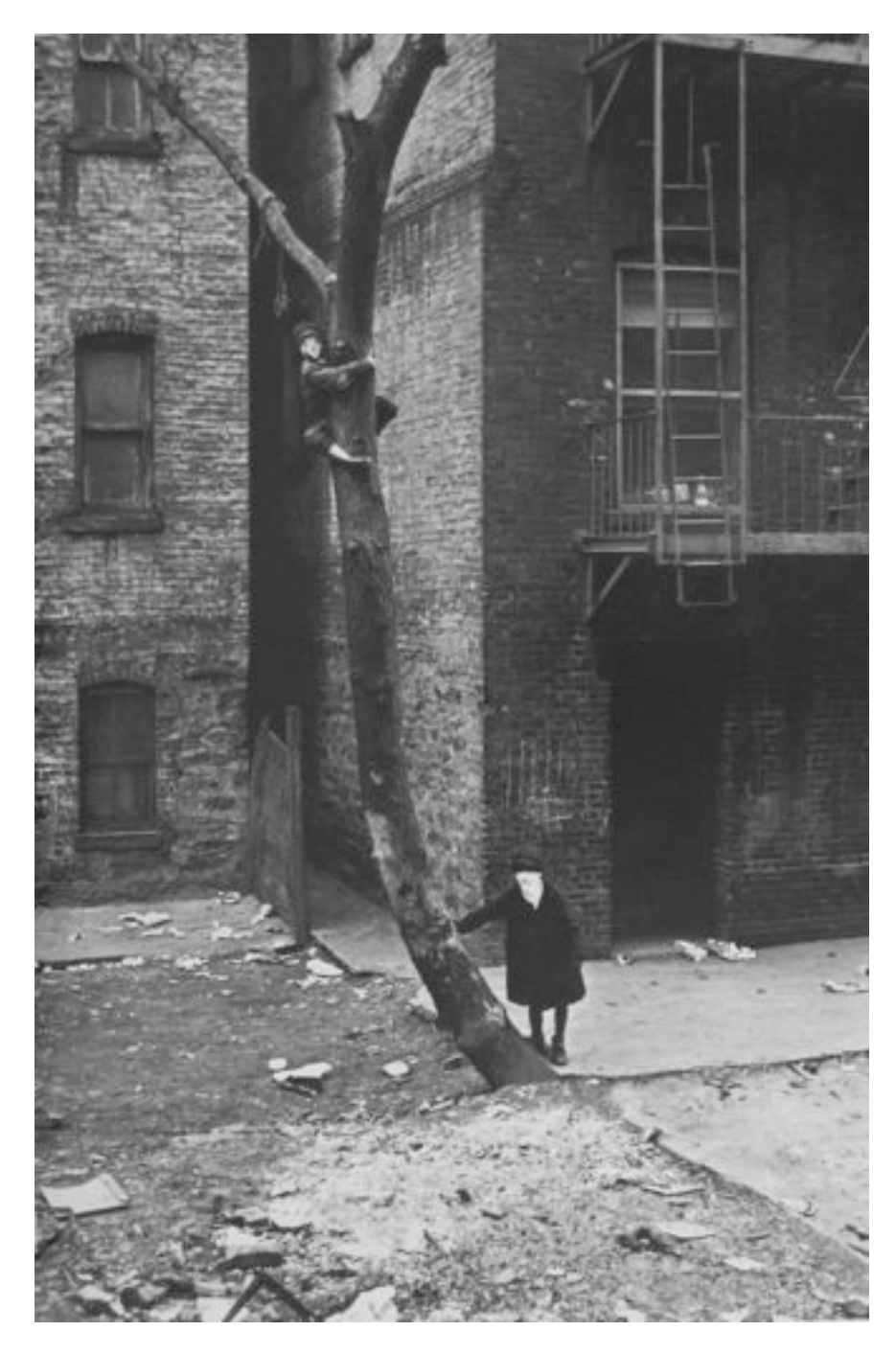
Figure 8. Helen Levitt, Untitled, New York, 1938, gelatin silver print.