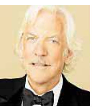
ANECDOTES: Donald Sutherland is "charming".