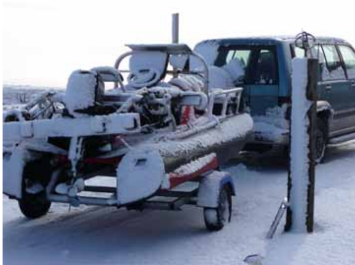
Working conditions in March were chilly!