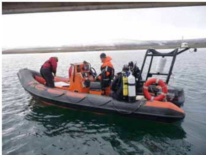
Setting out to dive, March 2010