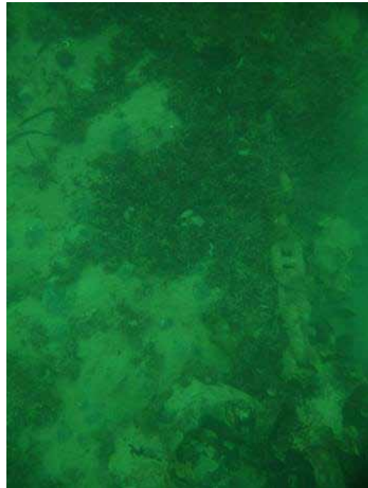
Chain at target WS1