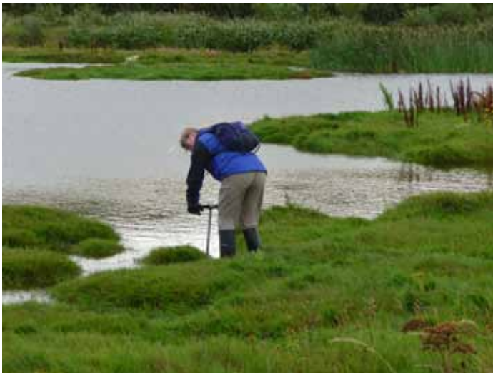
Using the probe at Dam of Hoxa

Work for the Scapa Flow Landscape Partnership in 2010 will include sediment sampling in Mill Bay, Hoy, and Dam of Hoxa, South Ronaldsay.