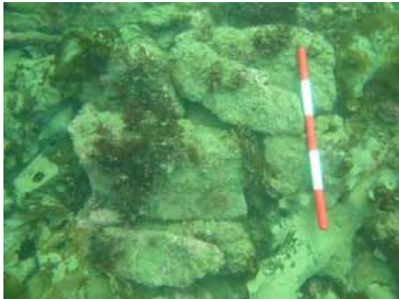
Stone at Target ST1

Twenty-seven potential targets were identified and fourteen dives undertaken. While some of the targets could be recorded as natural most require more detailed work in order to categorize them, and all are of interest with regard to the construction of the natural history of the bay.