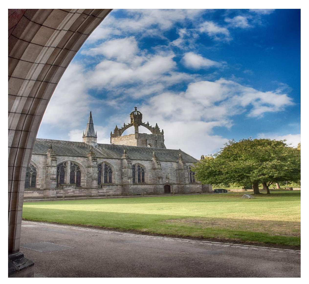
"Open to all and dedicated to the pursuit of truth in the service of others" Bishop Elphinstone, 1495