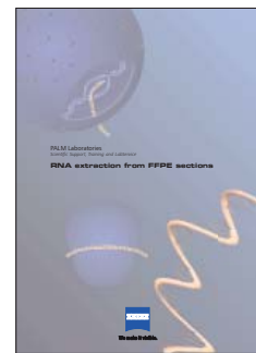
Short Protocol RNA extraction from FFPE sections