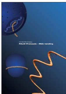
PALM Protocols RNA handling