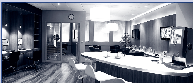
UCAN – urological cancer centre within Aberdeen Royal Infirmary

For further information contact: Zoë Skea, email z.skea@abdn.ac.uk , telephone 01224 438190