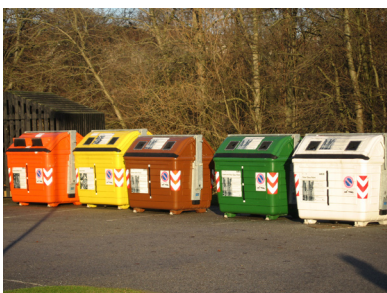
Recycling Point at Hillhead

Please do not leave any litter or plastic bags at the Recycling Points, you should take these home with you. You can obtain a free Waste Aware reusable sack to carry your small recyclates, please email WasteAware@aberdeencity.gov.uk