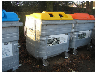
Crombie Johnston Recycling Point